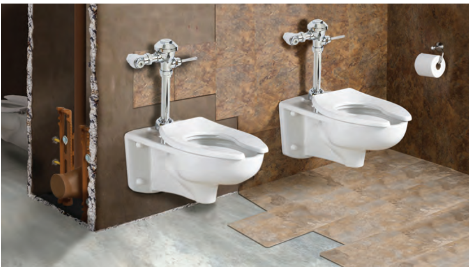
The new design of Jay R. Smith Mfg. Co.'s Quarterback Water Closet Support provides versatility in prefabricating water closet batteries. Because they could assemble the units offsite, Braconier reduced costs and saved time while renovating Children's Hospital Colorado.