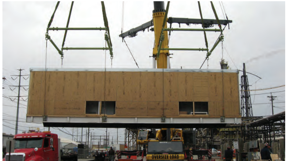
To set two 15' x 52' cooling tower unit sections inside an active, working refinery without disrupting day-to-day operations, BMWC worked with LGH to create a lift plan that maximized use of the heavy equipment, saving BMWC time and money.

For more information, visit www.lgh-usa.com .