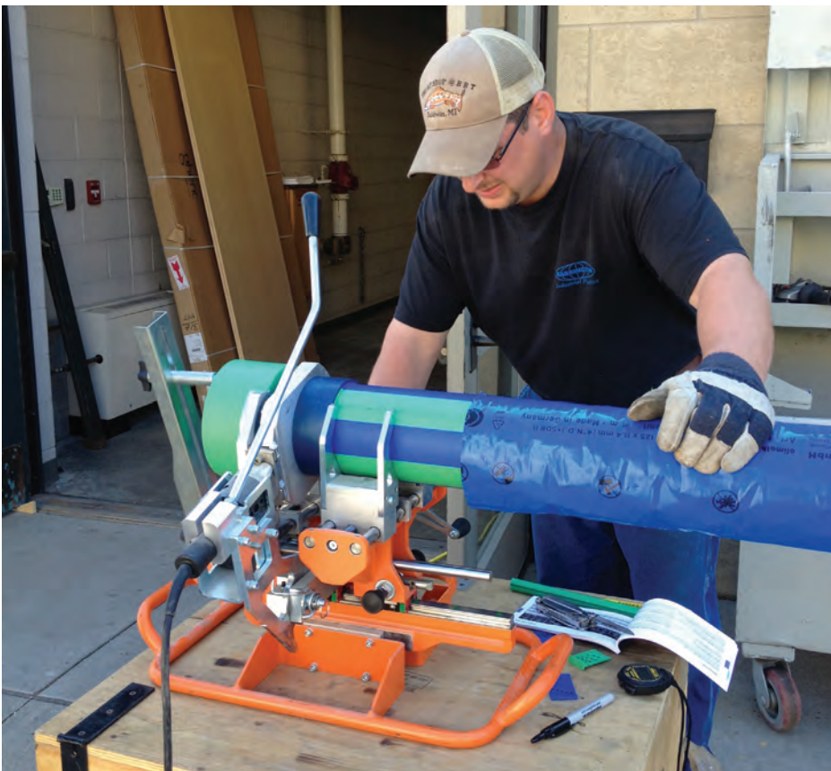
John E. Green workers were new to the heat fusing technique for Aquatherm Blue Pipe (shown here) but very quickly got the hang of it, cutting hours off the job.