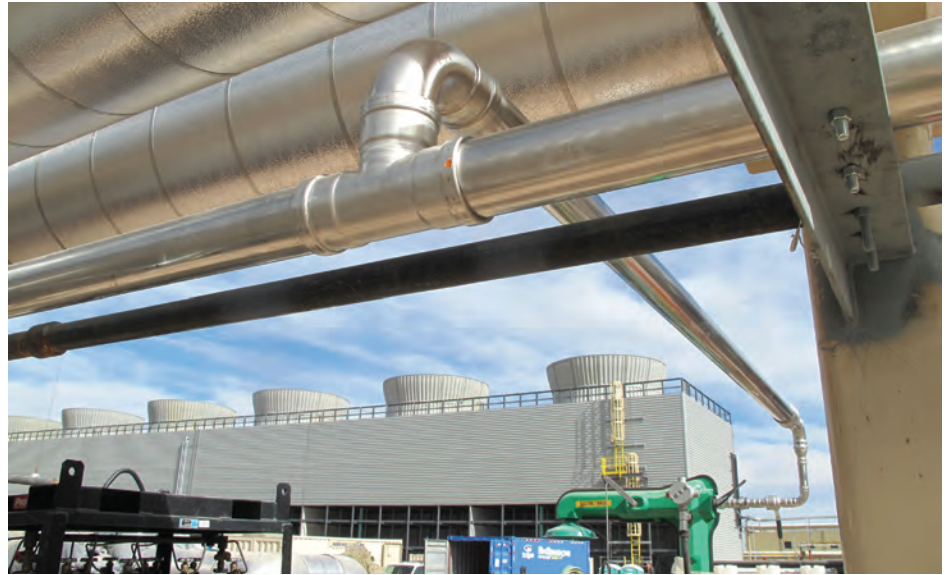
Using Viega ProPress dramatically cut the time it took for MMC Contractors to join 15,000’ of stainless steel piping in a new solar power plant.