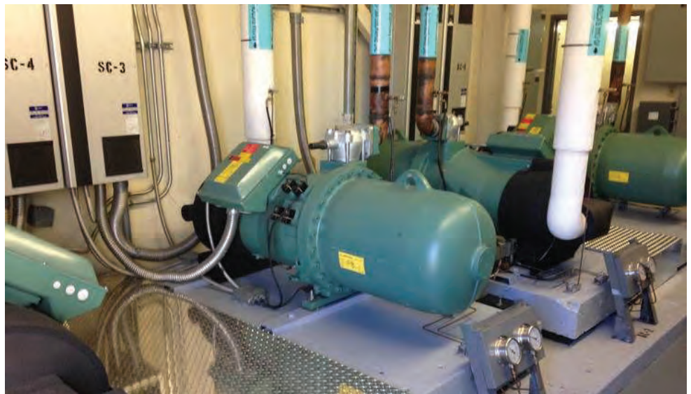
ACCO installed high-efficiency BITZER CSW95 retrofit conversion screw compressors to replace the aging, unreliable compressors at Cedars Sinai Medical Towers in Los Angeles. ACCO's attention to selecting the most energy-efficient, reliable product to meet the client's needs resulted in a substantial rebate, justifying the costs.

For more information, visit www.bitzer-ams.com .