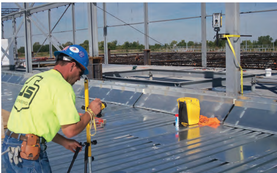
Using Trimble Robotic Total Stations, a U.S. Engineering worker in the field can lay out between 40 and 50 points an hour, which has helped the company locate more than 78,000 points for sleeves, embeds, floor penetrations, drains, and hanger supports so far in the new Mercy Hospital Joplin.

For the hospital project, the team used three Trimble RTS773 Robotic Total Stations connected to the Windows 7 Trimble Field Tablet and two Trimble RTS655 Robotic Total Stations