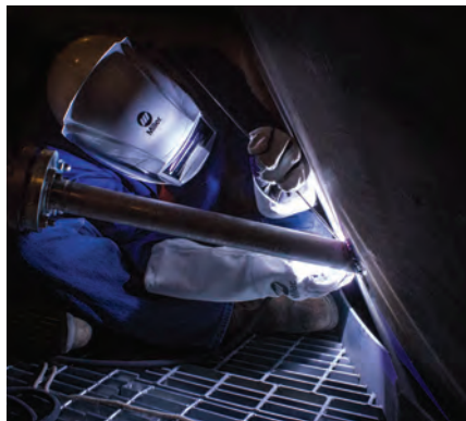
The simplified cable management of Miller Electric’s PipeWorx FieldPro saved Modern Piping journeyman pipefitters time by eliminating the communication cables that cause clutter on jobsites.

With the PipeWorx 350 FieldPro, the ability to make adjustments quickly from the weld site also helped save time and money. “It’s speed more than anything else—the efficiency that you get from this machine and this equipment, especially the FieldPro Remote, being able to turn up and down your amperage when you need that done,”