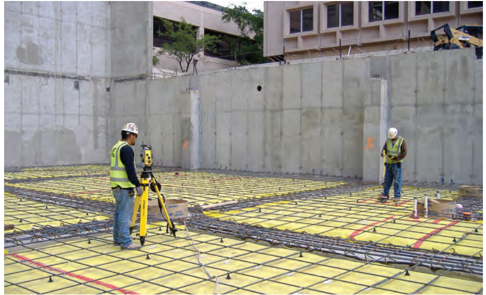
Using the Autodesk Point Layout and a total station, MMC Contractors slashed time spent laying out points in the field, and because the process didn’t require that concrete floors be poured first, they saved as much as three weeks per floor installing the hanger points and hangers for the new Martin Army Community Hospital.

MMC Contractors’ new point layout process didn’t require that floors be poured first. A team of two used a