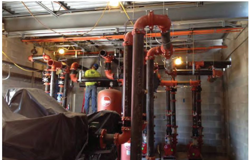
To speed up installation of multiple air handling unit hook-ups and VAV connections in Dayton's new Early Childhood Learning Center, Starco used GRINNELL grooved steel piping, 2-1/2" through 6" in the mechanical room, and up to 2" GRINNELL G-Press Copper press in the distribution piping.

During the bid process, Starco, a small mechanical firm of approximately 20 employees, knew they would have to deliver a solution that was both efficient and effective. Project leads considered various options when designing the system for the Learning Center. The facility had to connect multiple air handling unit hook-ups, as well as VAV connections. To speed up the installations, Starco planned the hot and chilled water systems throughout the building using GRINNELL grooved steel piping, 2-1/2" through 6" in the mechanical room, and up to 2" GRINNELL G-Press Copper press in the distribution piping.